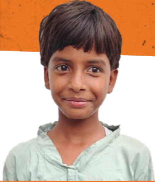
SWETA HIO2321 - $55

WE HAVE SEEN FIRST-HAND THE SIGNIFICANCE OF YOUR SPONSORSHIPS AND PROJECT SUPPORT IN INDIA, NEPAL AND BANGLADESH DURING OUR TEAM'S RECENT TRIPS. EACH SPONSORSHIP MEANS A CHANGED FUTURE FOR THAT CHILD, THEIR FAMILY, AND THEIR COMMUNITY.